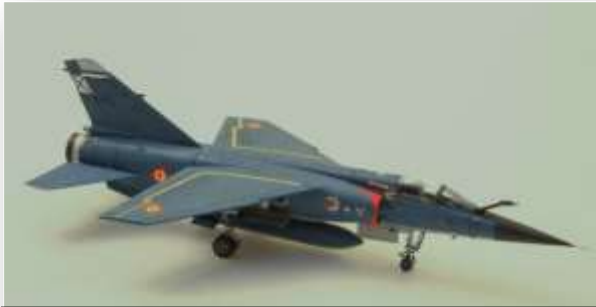
Aircraft 1/72, 1 st Place Mirage F1C by Vivian Watts