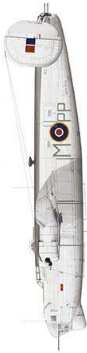
Liberator G.R. Mk. V BZ716 "PPOM", No. 311 Sqn. RAF, Tain, 1945