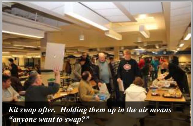
Kit swap after. Holding them up in the air means "anyone want to swap?"