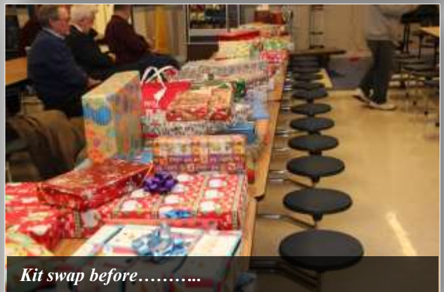
Kit swap before.....