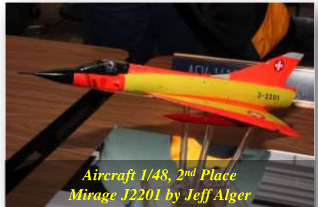
Aircraft 1/48, 2 nd Place Mirage J2201 by Jeff Alger