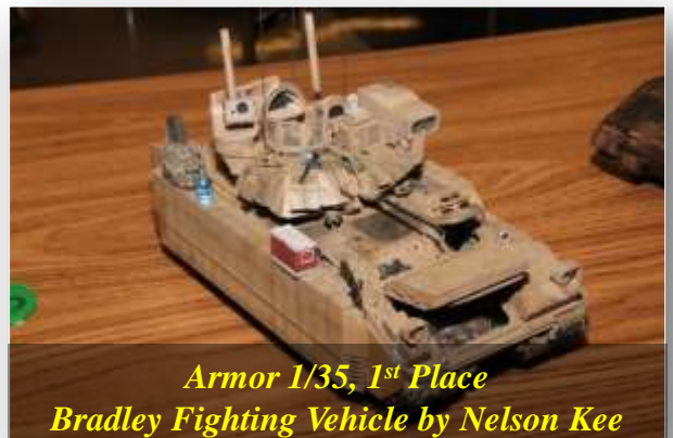
Armor 1/35, 1 st Place Bradley Fighting Vehicle by Nelson Kee