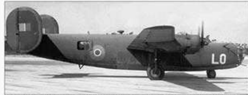
Liberator B. Mk. III BZ762 "LO" (No. 111 (C) OTU) in the Bahamas. The USAAF assigned the Liberator to the 111 (C) OTU on 2nd April 1944. It arrived at Fort...