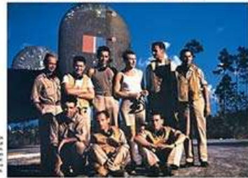
A full crew of Liberator BZ762 "LO". A full crew of Liberator BZ762 "LO" (No. 111 (C) OTU) in the Bahamas. The aircraft carried a standard RAF camouflage...