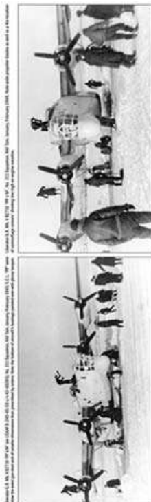
Liberator G.R. Mk. V BZ716 "PPOM" (No. 311 Sqn.) in the Bahamas. The aircraft carried a standard RAF camouflage...