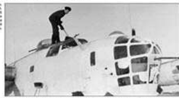
Liberator G.R. Mk. V BZ716 "PPOM" (No. 311 Sqn.) in the Bahamas. The aircraft carried a standard RAF camouflage...