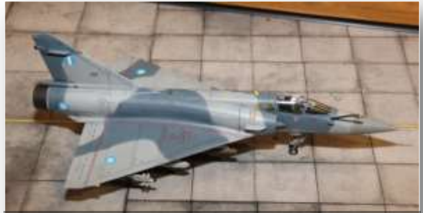
Aircraft 1/72, 2 nd Place Mirage III by Jim Fitzgibbon