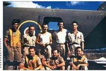
Liberator B. Mk. III BZ762 "LO" (No. 111 (C) OTU) in the Bahamas. The aircraft carried a standard RAF camouflage...